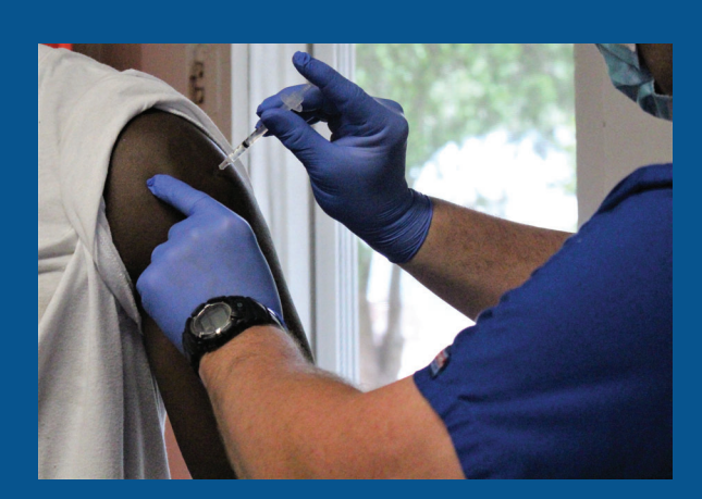
An incarcerated individual at Louisiana State Penitentiary receives the COVID-19 vaccine in April 2021.