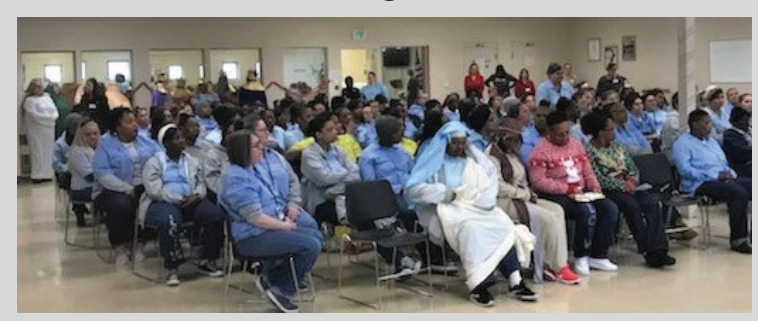
2019 LCIW Christmas Pageant guests

programs available to incarcerated individuals in prisons. "They'll be able to reenter society and have a life they had dreamed of but never did have the ability because of their environment and various circumstances in their life."